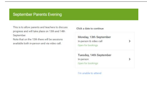
Step 2: Select Parents' Evening

Step 1: Login = https://sircps.schoolcloud.co.uk/=Fill out the details on the page then click the Log In button.A confirmation of your appointments will be sent to the email address you provide.