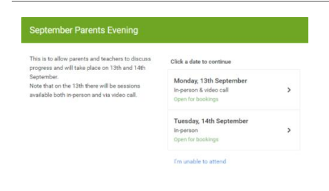
Step 2: Select Parents' Evening

Step 1: Login = https://sircps.schoolcloud.co.uk/=Fill out the details on the page then click the Log In button.A confirmation of your appointments will be sent to the email address you provide.